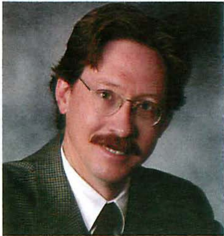
by R. Michael Shickich

The combination of a growing deer population and increased urban sprawl has resulted in an increase in the number of collisions between cars and deer. According to the National Institute for Highway Safety, there are 1.5 million such collisions each year, killing some 150 people, injuring many others, and costing millions of dollars in property damage.